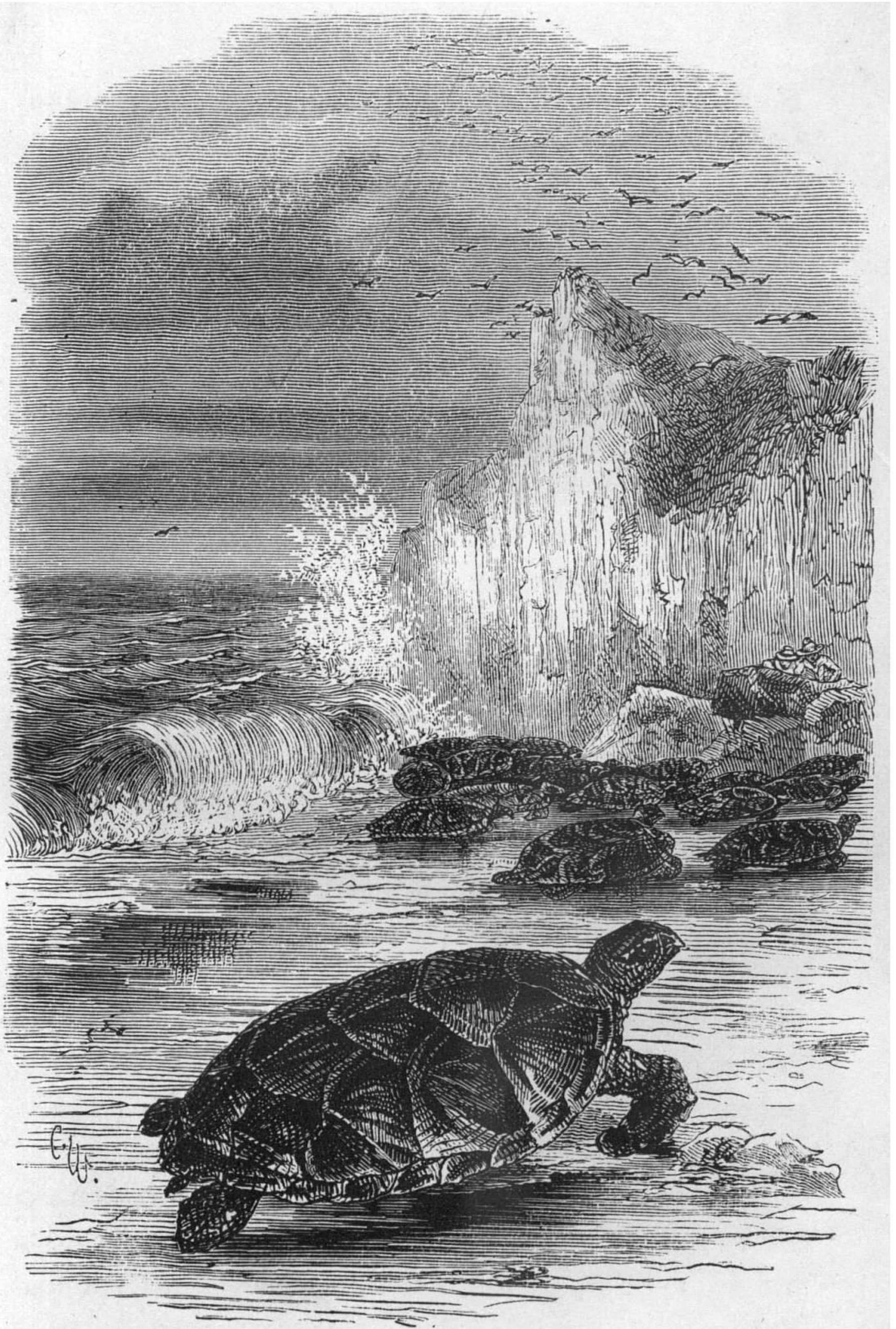
TURTLES COMING ON SHORE.