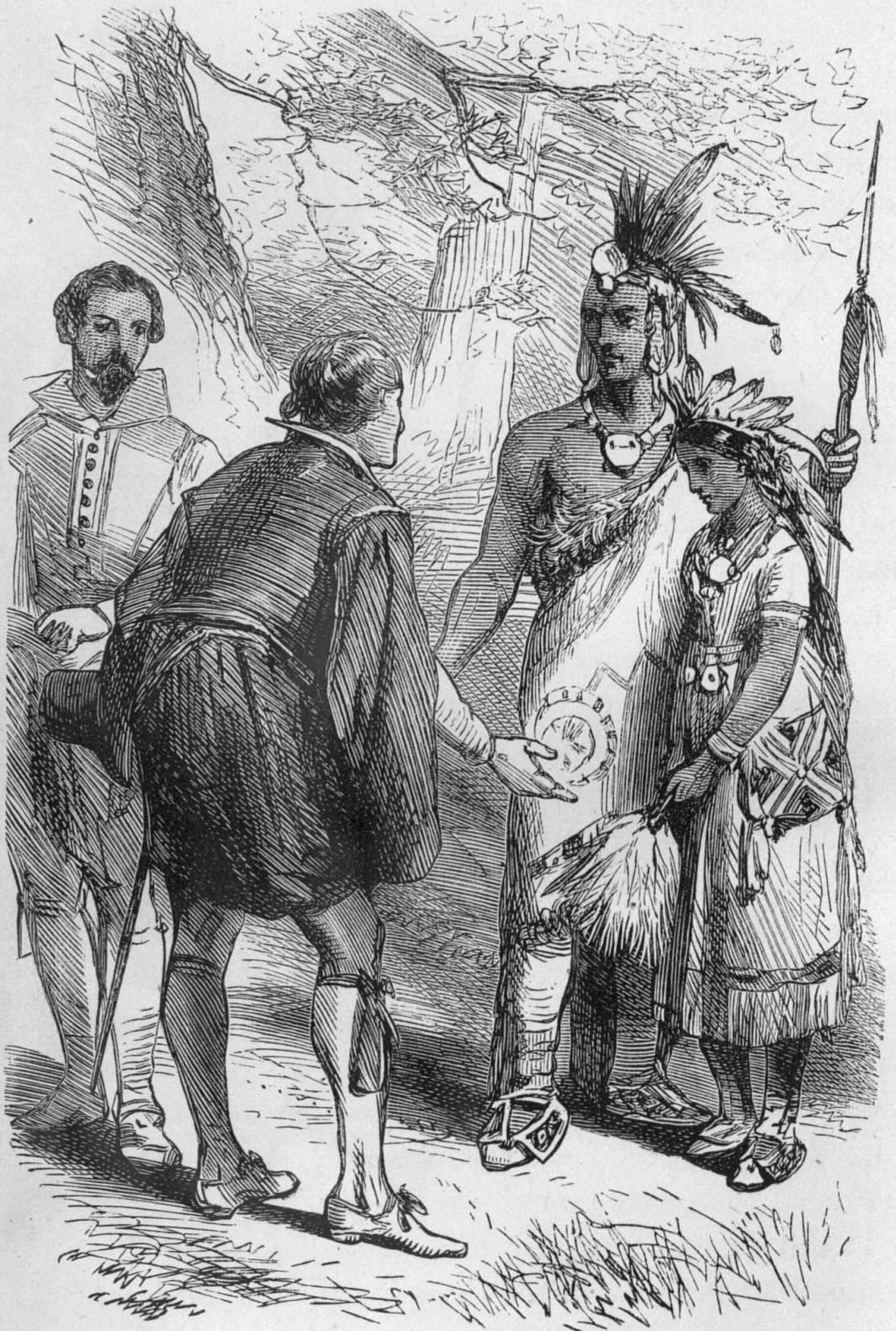
POWHATTAN AND HIS DAUGHTER.